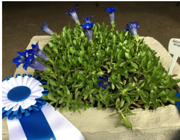
Gentiana acaulis