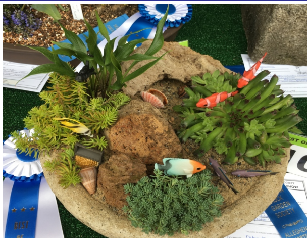
Hosta 'Corkscrew', Sempervivum 'Oddity', Sedum nevii 'Silver Frost', Sedum rupestre 'Angelina'