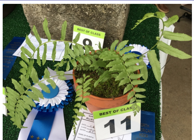
Asplenium atropurpurea Joanne Burzese