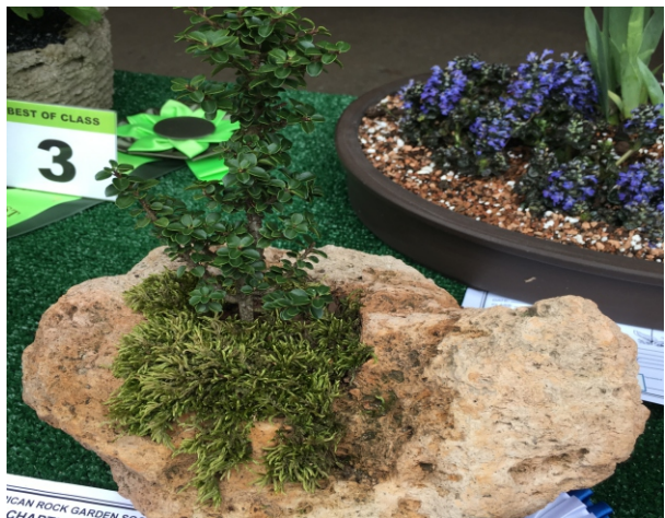
Ilex crenata 'Jersey Jewel' Sandra Ciccone