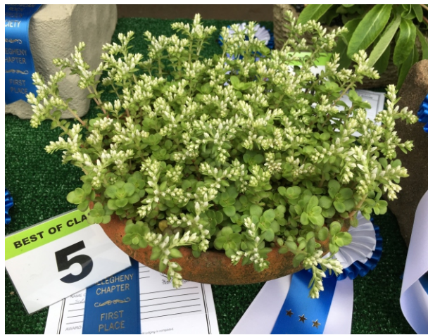
Sedum ternatum Lyn Lang