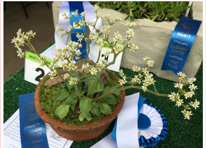
Micranthes virginiensis