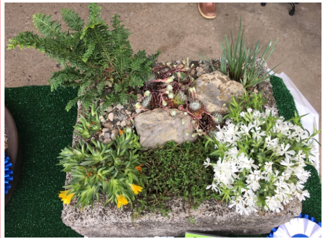
Chamaecyparis obtusa 'Fillicoides Compacta', Sempervivum arachnoideum , Sisyrinchium sp., Lysimachia japonica 'Minutissima', Phlox subulata 'Snowflake', Delosperma basuticum Debra Meyer