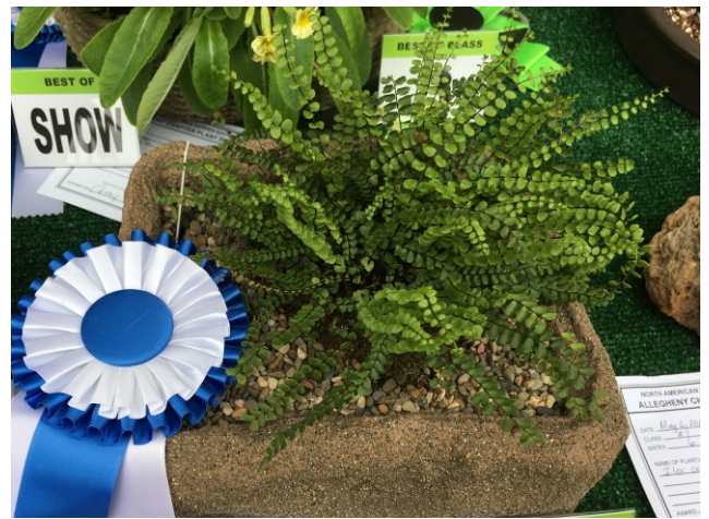
Asplenium trichomanes Al Deurbrouck