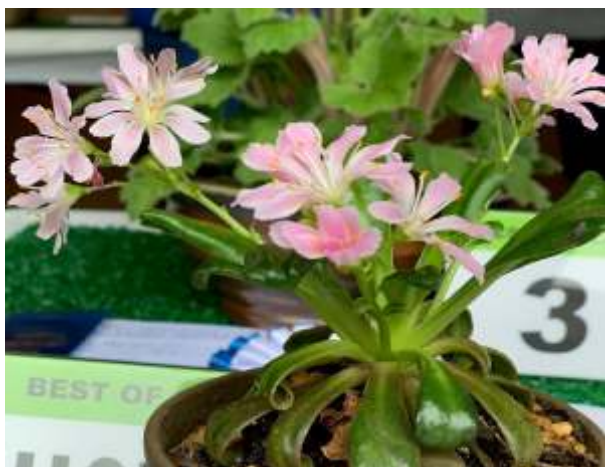
Lewisia cotyledon