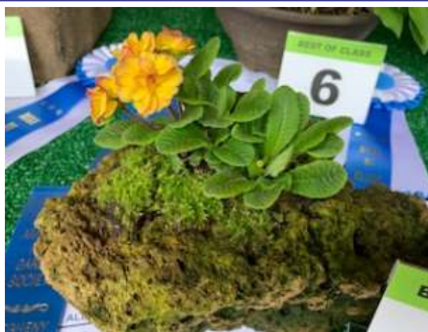
Primula vulgaris belarina 'Nectarine'