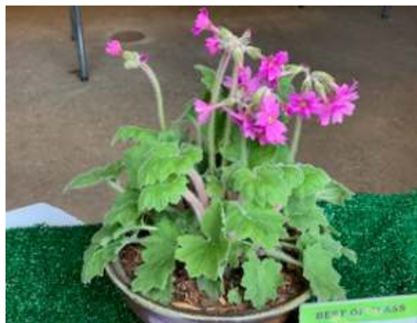
Primula kisoana Sandra Ciccone