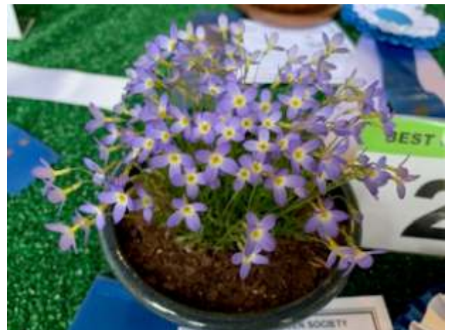
Houstonia caerulea Sandra Ciccone