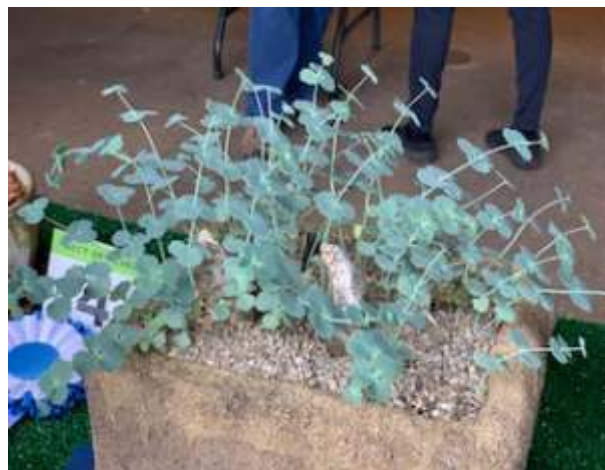
Sedum sieboldii Al Deurbrouck