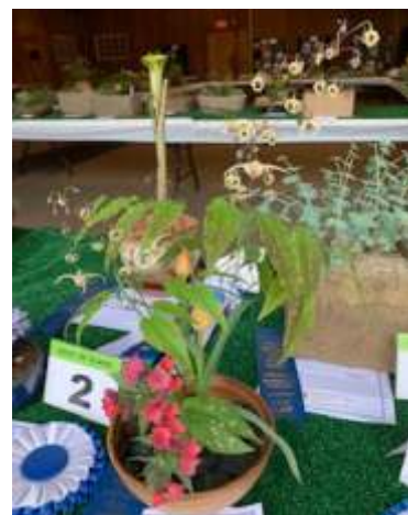
Epimedium, Species Tulip, Pulmonaria Trish Abrams