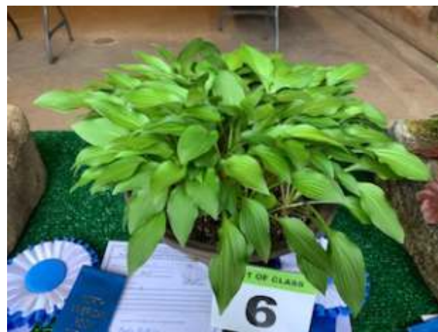
Hosta sp.